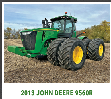
2013 JOHN DEERE 9560R

AUCTIONEERS NOTE: Excellent opportunity to purchase late model, low hour equipment including John Deere Tractors & Combine, Tillage, Air Seeder, Trucks, and Trailers. Most equipment always stored inside with an excellent maintenance program in place.