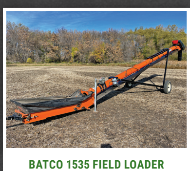
BATCO 1535 FIELD LOADER