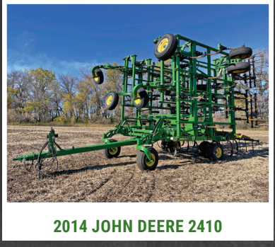
2014 JOHN DEERE 2410