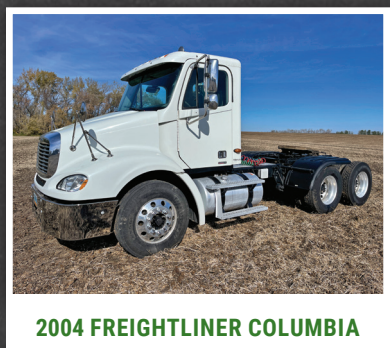
2004 FREIGHTLINER COLUMBIA