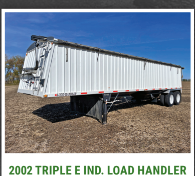
2002 TRIPLE E IND. LOAD HANDLER