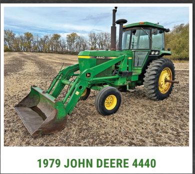
1979 JOHN DEERE 4440