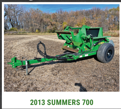
2013 SUMMERS 700