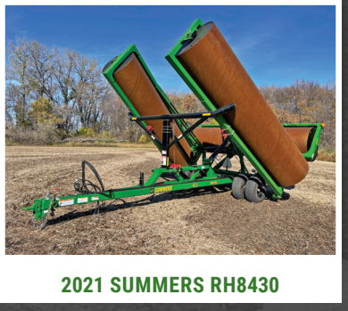
2021 SUMMERS RH8430