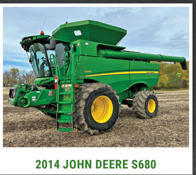
2014 JOHN DEERE S680