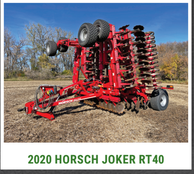
2020 HORSCH JOKER RT40