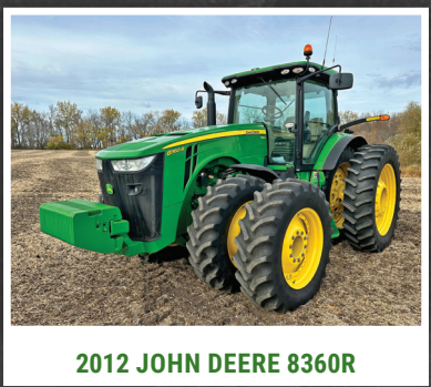
2012 JOHN DEERE 8360R