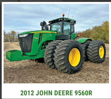
2012 JOHN DEERE 9560R