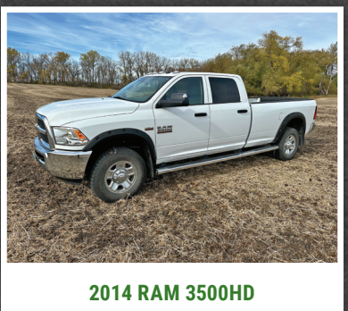
2014 RAM 3500HD