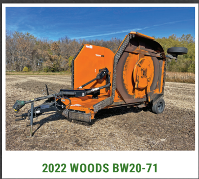
2022 WOODS BW20-71