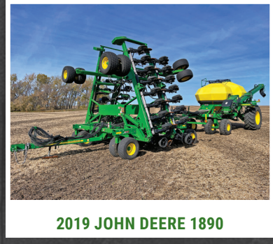
2019 JOHN DEERE 1890