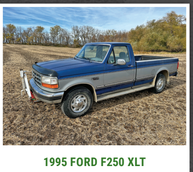
1995 FORD F250 XLT