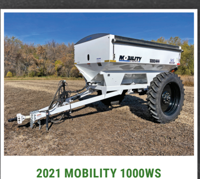
2021 MOBILITY 1000WS