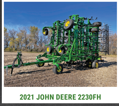
2021 JOHN DEERE 2230FH